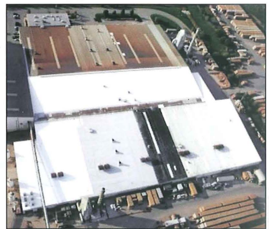
Sustainable cool roof — no rust!

An ASTEC® Re-Ply™ roof conversion can be half the price of replacing a roof, without disposal or downtime expenses. Converting an existing metal substrate can be viewed as a maintenance expense, or as a capital expenditure. There are often additional "Green" building incentives for cool roofing.