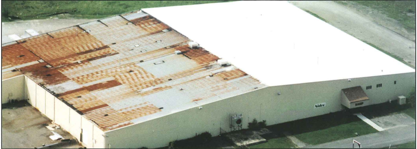
Leaky, rusting metal substrates are converted to seamless, sustainable cool roofs.

With hundreds of millions of square feet applied since 1986, ISO 9001 Registration, multiple accreditations, and the highest quality materials... ASTEC is the right choice.