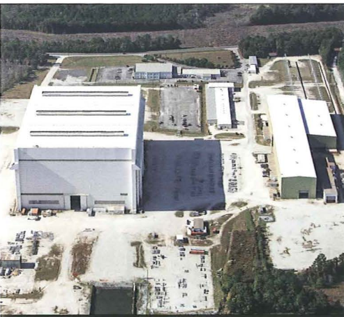
Going fluid-applied at 277 feet up

The cost was prohibitive to replace the failing metal roof of this massive 227 foot tall facility. The ASTEC® Re-Ply™ fluid-applied solution was so cost effective, five other roofs were added to this ASTEC project.