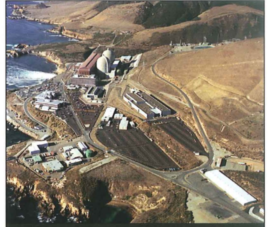
Nuclear complex in salt mist

The multiple metal roofs at this oceanside nuclear facility were being hammered with salt mist, airborne corrosives, high winds, intense UV rays, and the thermal shock of hot days and cool nights. Converting all to sustainable ASTEC® Re-Ply™ Roofing was a total solution.