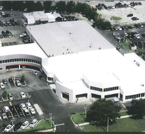
Going seamless against sun & storm

Convert rusty, leaking metal roof maintenance headaches into sustainable cool roofing — without costly re-roof!