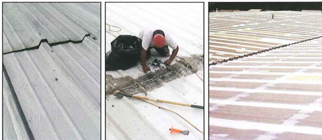
Fix wind lift & poor repairs; seal all seams