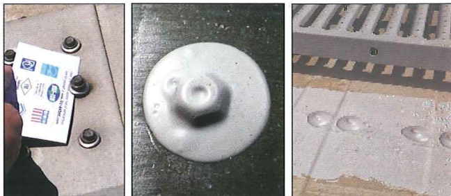
Tighten & seal loose & missing fasteners