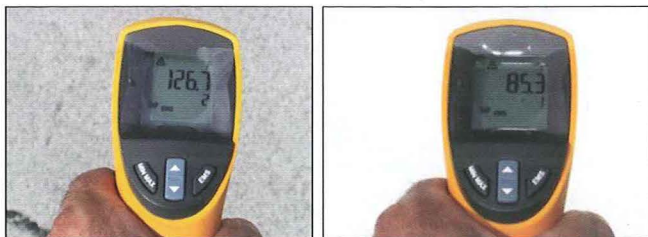
Maximize cooling efficiencies with ASTEC