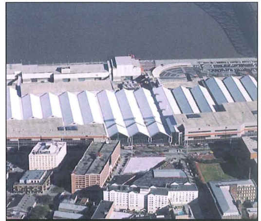
Hurricane Katrina survivor

In 2001, the New Orleans Convention Center went to a seamless ASTEC® Re-Ply™ Roofing System. In 2004, when Hurricane Katrina hit, that ASTEC roof held, giving dry shelter to hundreds of displaced people. In 2014, that same ASTEC roof continues its weathertight protection with unquestioned durability.