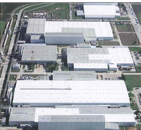
Scheduling by need & budget

ASTEC® Re-Ply™ systems allow building-by-building roofing conversions as needs arise — and budgets demand.