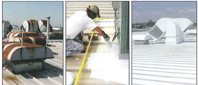
Flash & seal penetrations, curbs, parapets