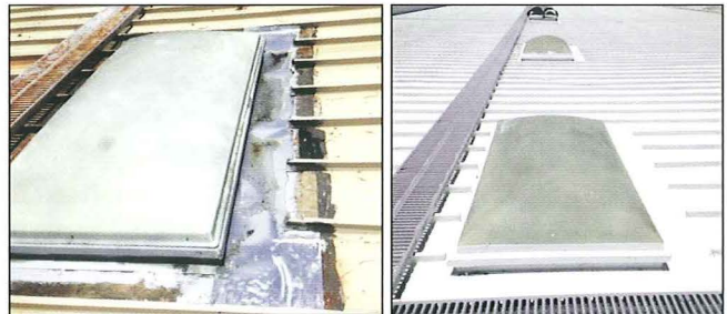
Restore substrate integrity as necessary